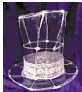
Clear top hat for Jack made of hat wire, florist tape and shrink wrap.