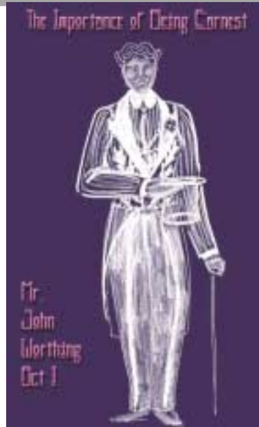
Rendering of John "Jack" Worthing, created by the author in Photoshop.